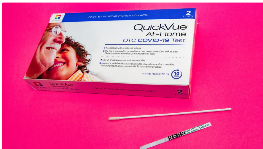
That expiration date on your COVID-19 test box might not be accurate.

For the most up-to-date news and information about the coronavirus pandemic, visit the WHO and CDC websites.